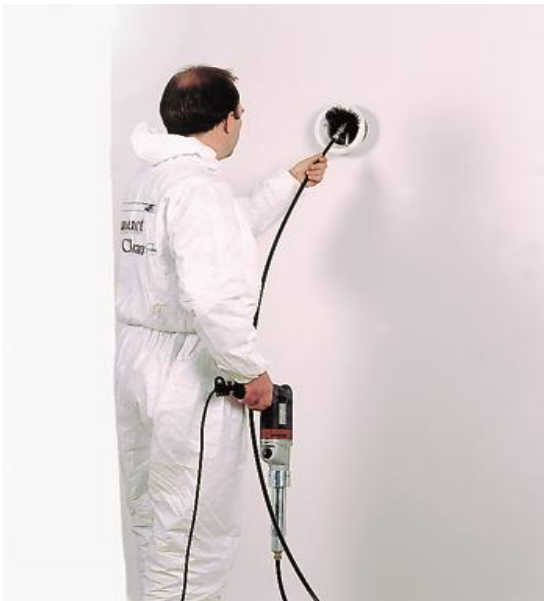
Easy one person operated PD4 duct cleaning machine, brushes and shafts

The high speed power drill and soft brushes clean small ducts from 63 mm to 150mm swiftly and efficiently, saving time in transport and set up time.