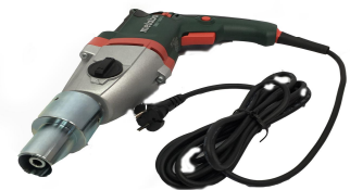
Metabo powerdrill incl. Shaft head