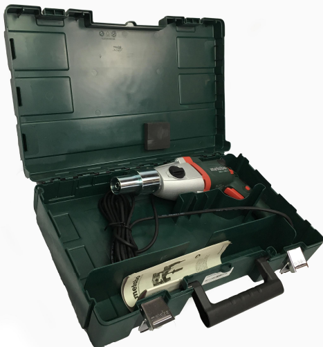
Metabo power drill transport box